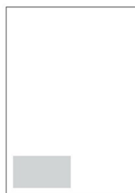
Business card 88.5 x 55mm