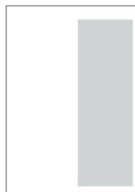
Half-page (vertical) 88.5 x 264mm