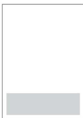
Quarter-page (horizontal) 181 x 65mm