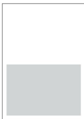
Half-page (horizontal) 181 x 130mm